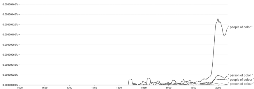
TABLE 3: GOOGLE NGRAM (USE OF THE TERM “PEOPLE OF COLOR” AND THREE VARIANTS) 242

According to the Google English language corpus, the term first appeared in the early nineteenth century, although it was originally phrased as “people of colour.” Several variants soon emerged, including “person of colour” and “person of color.” The term “people of color” became the preferred phrasing by 1940. Its use increased significantly in the 1950s, coinciding with the rise of the civil rights movement in the United States. By then, the term was much broader in scope. The use of the term reached its peak in 2001. By that time, other terms had entered the lexicon and were also being used, such as “minorities,” “indigenous people,” “marginalized groups,” and “disadvantaged communities.” But “people of color” remains an accepted and common term.